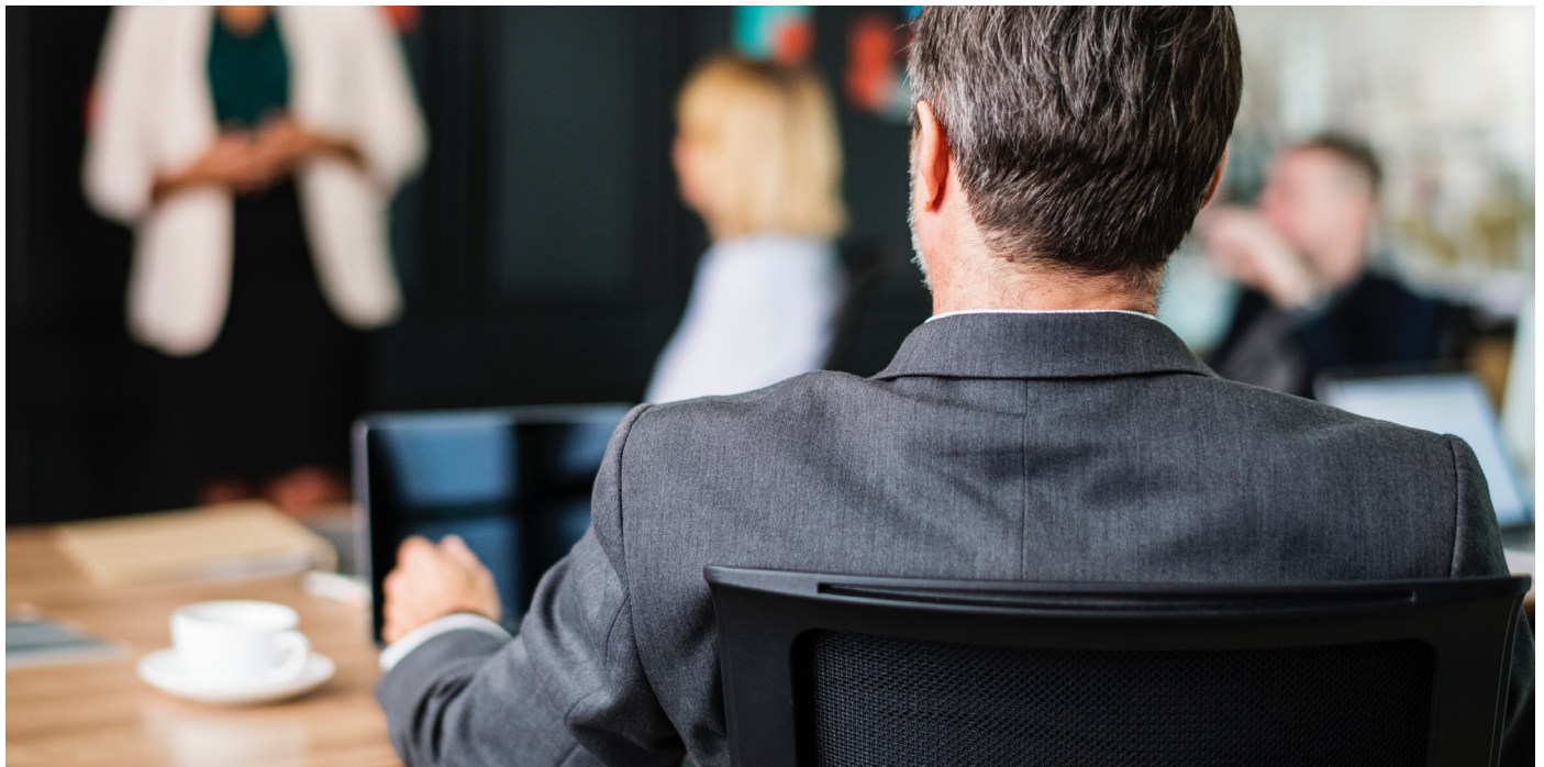
This document has been prepared with the sole purpose of simplifying the understanding of some parts of the EU-Japan EPA and bears no legal standing. © Copyright EU-Japan Centre 2019