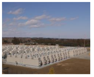
Stationary Battery Energy Storage Systems