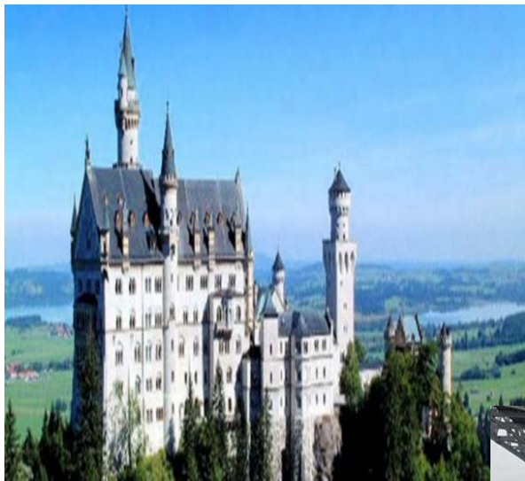
Headquarter in EU