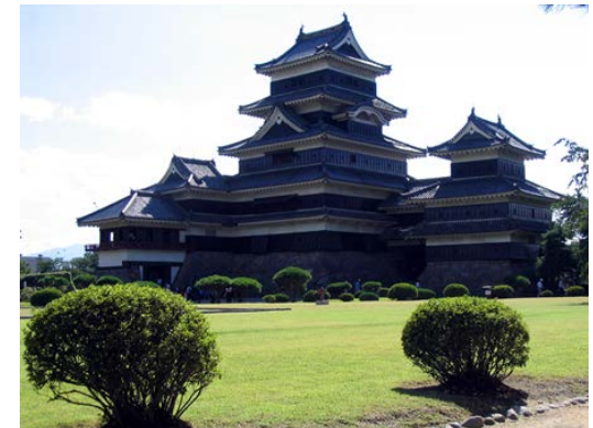
Branch or Subsidiary in JAPAN