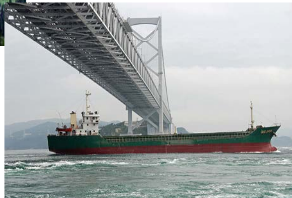
Presence in Japan Corporation tax