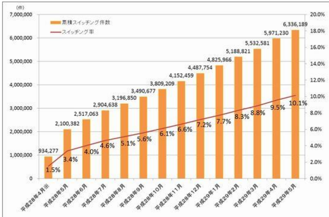
Switching cases and ratio from April 2016 to May 2017