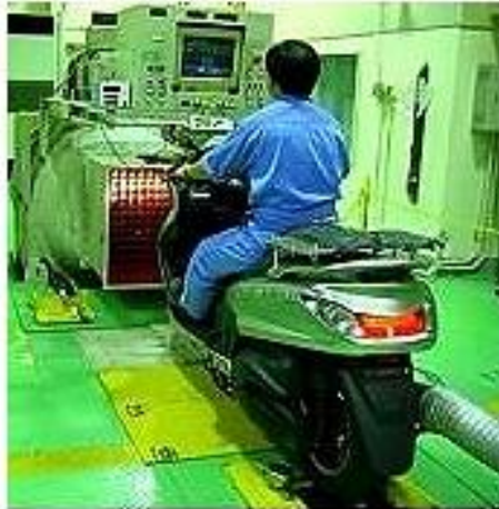
Measurement of gaseous exhaust emissions of motorcycles