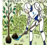
Remote Labor/ Disaster Rescue